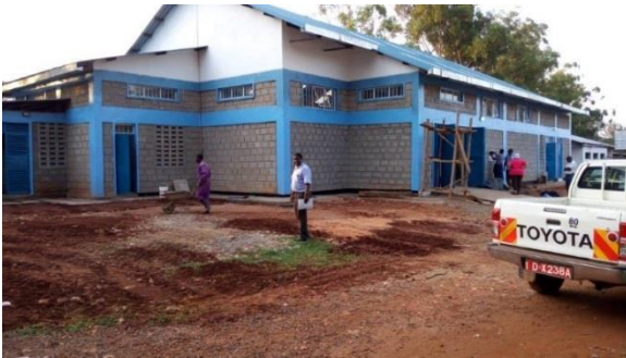
Dairy processing plant.