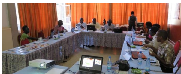
The group started an animated analyses.

For the trainer it was great to have the old students back at the seminar in order to exchange all experiences since the first management training cycle that started in 2012.