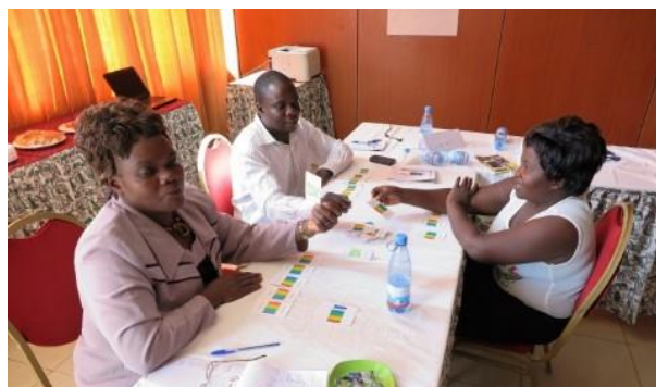
Three subgroups are increasing their free space by giving feedback on personal core qualities.

The afternoon program was used for further team building by playing the feedback game (Gerrikens et al). The feedback game provides a good instrument to discuss each other's core qualities, thus experiencing the power of good feedback and increasing the team's free space.