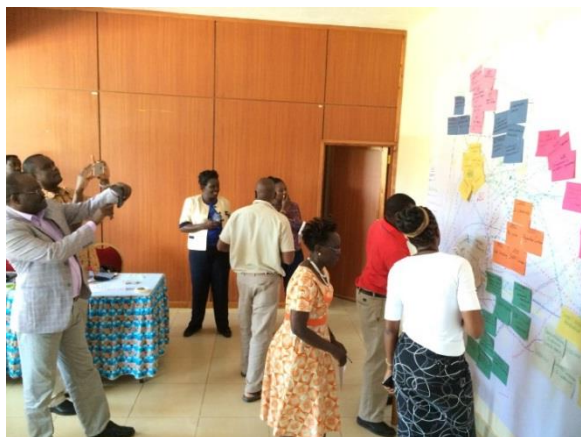
Sharing knowledge and experiences.

Some of the conclusions and recommendations for NICHE project implementers: