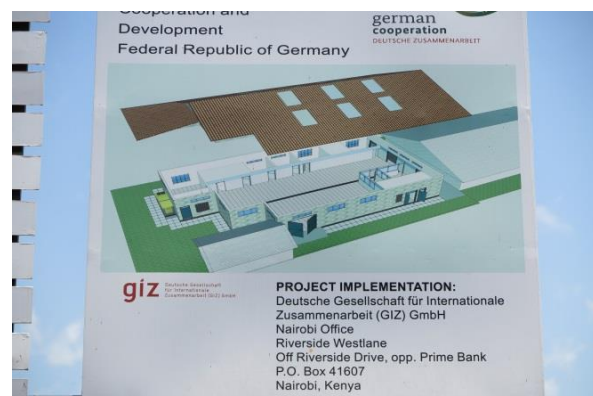
GIZ project information board.