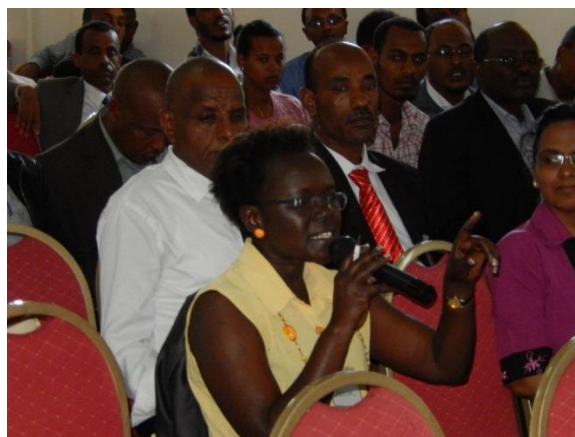
Questions from the audience.

Inclusion of other East African Countries was a good idea for one-on-one sharing. For Bukura College there was linkage benefit forged with Agarfa ATEVT College in the area of curriculum development. Bukura is planning to develop a Diploma Course in Irrigation. Agarfa College had developed one which Bukura gave its input, and is planning to use this curriculum as it develops one. Now the two colleges are in communication and in this many other areas could be identified.