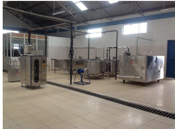
Dairy processing equipment.

This plant will benefit farmers from Kakamega, Bungoma and Siaya counties as a research center, a market for the locals and at the same time a plant for training students. The dairy processing building was financed by the German GIZ organization and the processing equipment by the Niche project.