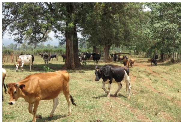
BAC's Dairy herd.

It was in this role that we could connect BAC with SNV and a young team of the new consortium "Management Dairy Consultants" (MDC).