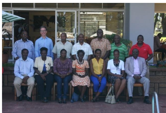
Participants of the NICHE Programme, all the 14 institutions implementing the Niche project projects in Kenya were represented by one staff.