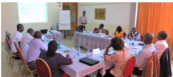
Presentation of the dialogue results on "Who moved my cheese".

The second day workshop served the purpose to (re)accommodate the groups of HOD and HOS in change management, since a number of positions was changed in the last years. Still it was good to be able to see a number of "old" familiar faces. We had a dialogue about the present status of management in BAC. We concluded that BAC is standing for a major challenge in the near future and were glad we could help the attendees with the basics of change management and implementation.