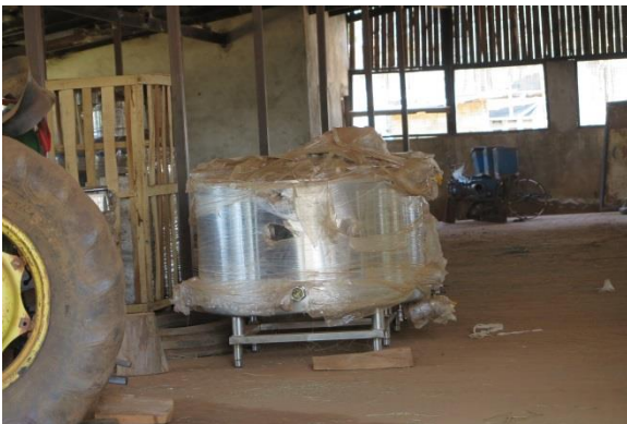
Our project's equipment waiting for the building to be finished.