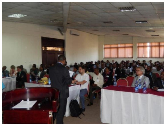
Enthusiastic and interested audience.