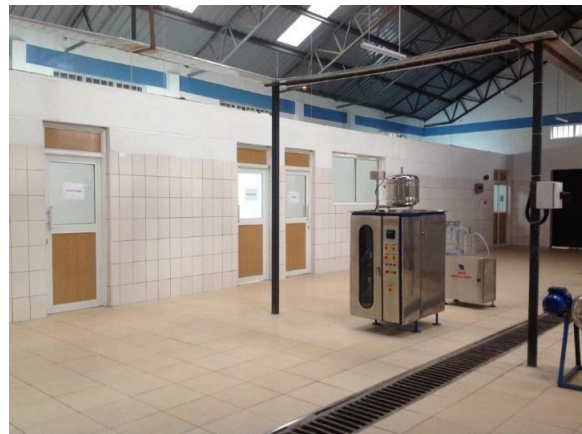
Modern dairy processing facility.